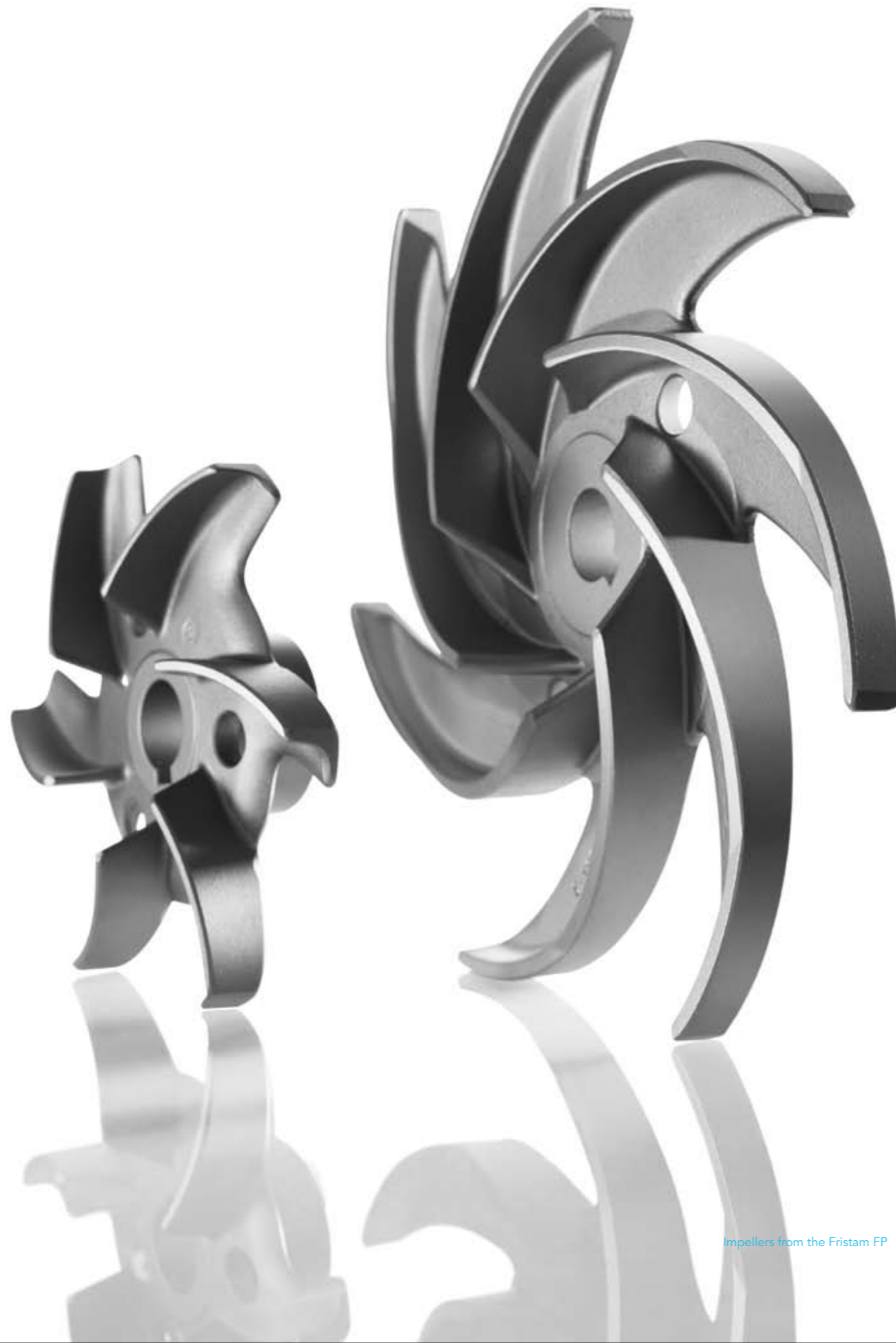
Impellers from the Fristam FP