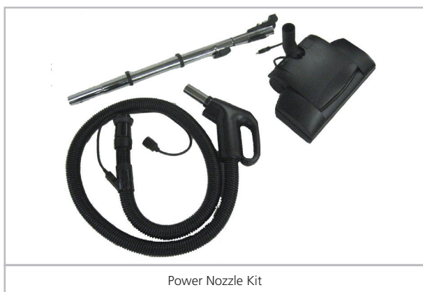
Power Nozzle Kit