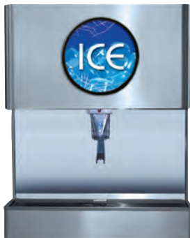
ID 4400 30" 250 lb Ice Dispenser

The ID 4400 30" is designed using the highest quality materials and state-of-the-art technology providing our customers with consistent quality and ice dispensing.