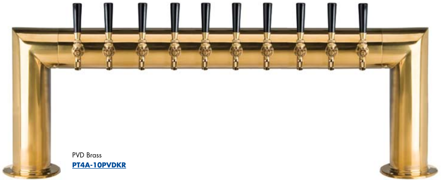
PVD Brass PT4A-10PVDKR