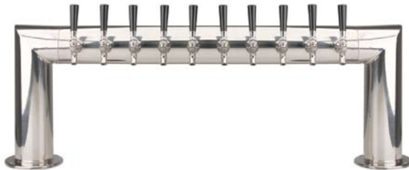
Stainless Steel PT4A-10PSSKR