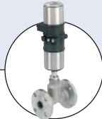
Type 2101 (8692)