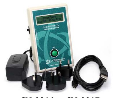
CM-0016 or CM-0017