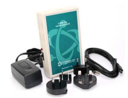
CM-0018, CM-0018AA, CM-0019, CM-0209, CM-0210 CM-0212, CM-0213