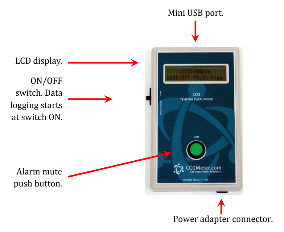
Figure 1: Data logger models with display