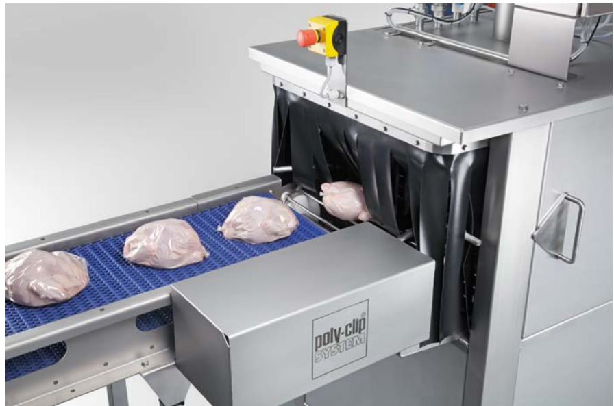
The vacuum products are continuously conveyed into the shrink tunnel on the conveyor belt.