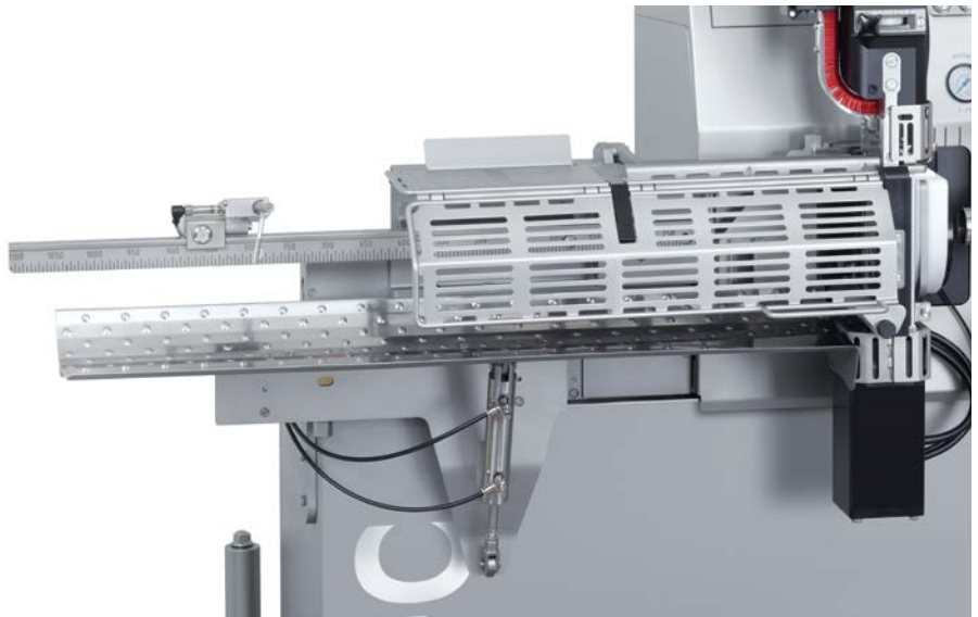
Hygienically designed discharge tray