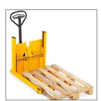
Picking up a standard Euro pallet