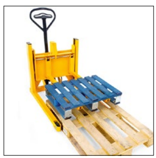
A half pallet is picked up from a standard Euro pallet