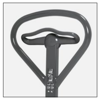
Ergonomic operating handle