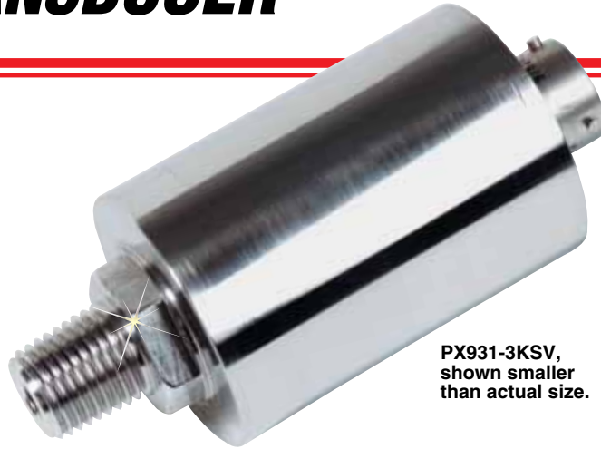
PX931-3KSV, shown smaller than actual size.

Excitation: 10 Vdc (15 Vdc max) @ 30 mA Output: 30 mV \pm 0.25\% @ 10 Vdc Sensitivity: 3 mV/V Input Impedance: 350 \Omega min Output Resistance: 350 \pm 5 \Omega Insulation Resistance: >5 M \Omega @ 75 Vdc Accuracy: 0.15% Hysteresis: \pm 0.10\% Repeatability: \pm 0.05\% Zero Balance: \pm 1.0\% Shunt Calibration: 59 k \Omega Operating Temperature Range: -73 to 163°C (-100 to 325°F) Compensated Temperature Range: 16 to 71°C (60 to 160°F)