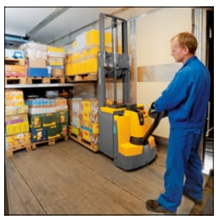
Double-deck lorry loading