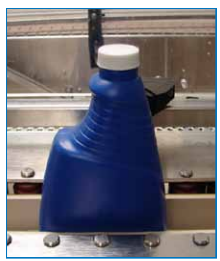
A bottle of household chemicals passes through a TapTone 4000-DSC.