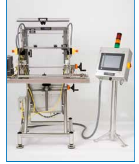
T4000 Dual Sensor Compression (DSC) System. Sensor has a cantilever design that suspends over the existing conveyor.

Utilizing advanced DSP technology the T4000 controller analyzes the comparative measurement and assigns a merit value to each container. If the merit value is outside of the acceptable range, a reject signal activates a remote reject system.