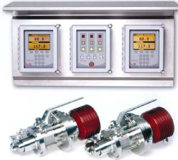
Figure 3. K-Patents Digital Divert Control System DD-23.

Should you have any questions regarding this document or the K-Patents Digital Divert Control System DD-23, please contact: