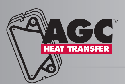
PLATE HEAT EXCHANGER FRAME