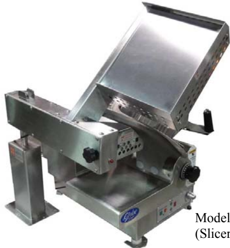
Model BW4B-1 (Slicer not included)

The Marshall Model BW4B-1 Slicer Warmer features patented ThermoGlo™ heating technology. Heat radiates from every square inch of the upper and lower flat plate surfaces maintaining uniform holding temperature and improved moisture retention for up to 45 minutes. The upper heat plate centers over the meat while the lower plate provides heat to the sliced meat as it falls onto the slicer landing area.